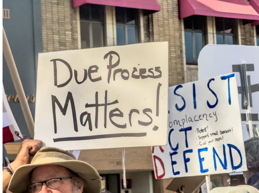
SANTA ROSA, CA, USA – APRIL 5, 2025: A man holds a sign that reads “Due Process Matters” during a public demonstration.